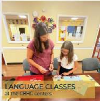
LANGUAGE CLASSES at the CBHC centers

It is my first time working in a non-profit organization. I am grateful for the opportunity it has given me to do what I am passionate about. I have the privilege of teaching my native language and somehow bringing both children and adults of our community together to know each other and interact.